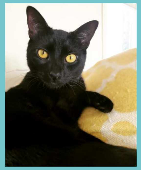
Tuna - Cat's Cradle Alum

Cat's Cradle has come too far over the years we can't lose ground in reducing pet overpopulation! Help us Beat the Heat by contributing from February 15<sup>th</sup> to April 1<sup>st</sup> . You can save lives by donating on our website or mailing us a check during that time. (Note: Donations must be above and beyond recurring or pledged donations.)